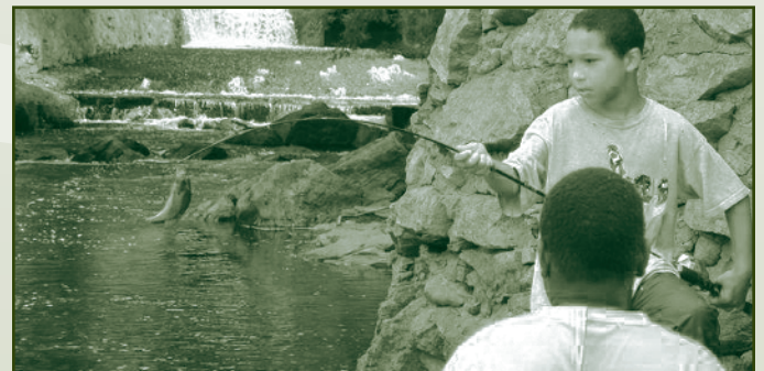
Youth Fishing Day in Downtown Lewiston-On August 11 ALT and Maine IF&W who provided the fishing equipment hosted Lewiston-based Tree Street Youth to a morning of fishing at Simard-Payne (Railroad) Park. Providing a fun outdoor experience for kids to help build pride in their community is exciting. We look forward to more of these events.